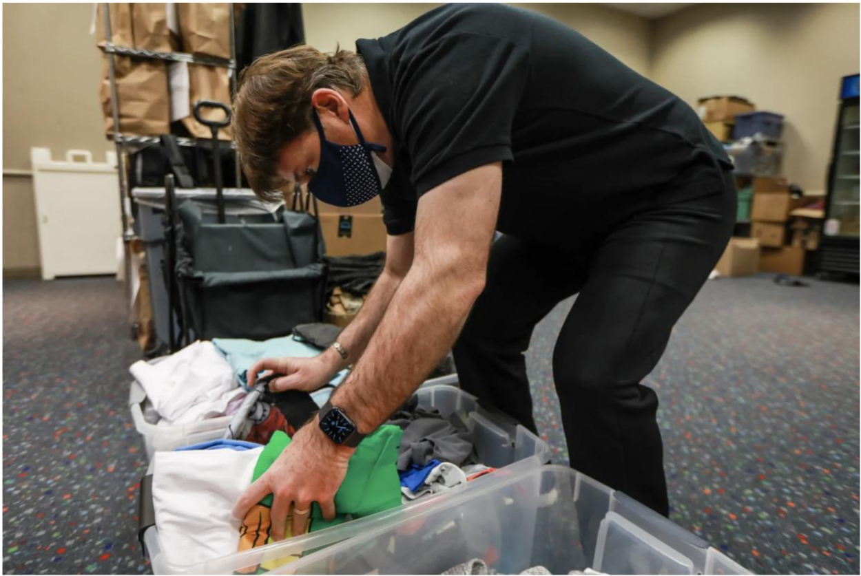
Ford Motor Co. CEO Jim Farley grabs a t-shirt for a guest request, while he works the front office at the Pope Francis Center in the TCF Center in downtown Detroit on March 6, 2021.

Farley, meanwhile, wore two face masks. His black running pants and vintage Nikes allowed him to quickly move between getting coffee cups and T-shirts to filling orders for toiletries.