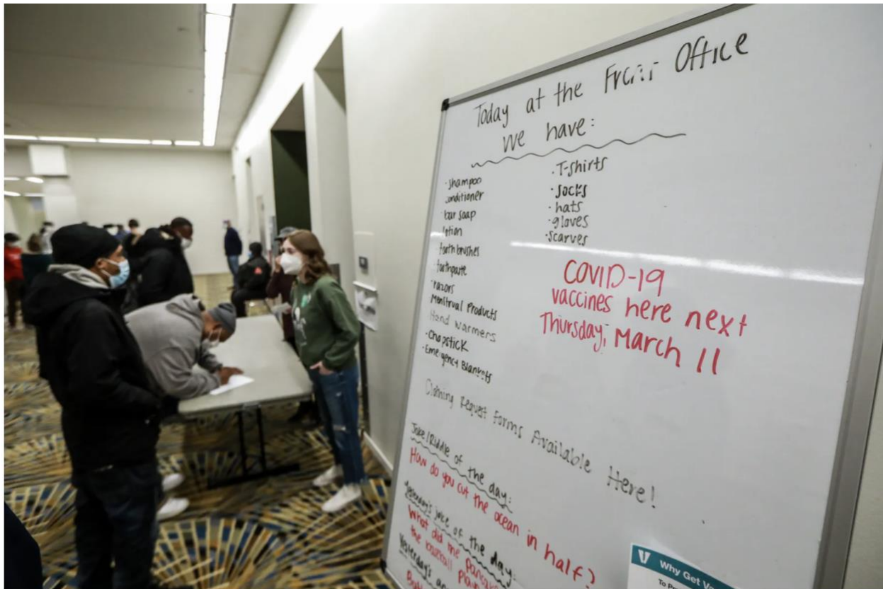
Men and women stop at the Front Office to receive vital resources like socks, gloves, and toiletries at the Pope Francis Center in TCF Center...